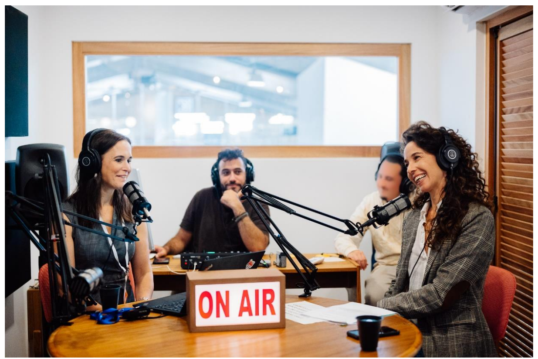
Recording podcast at Maala conference 2022.

The event was held at the <u>Design Terminal</u> in the city of Bat Yam, a non-profit social enterprise offering workspaces for designers and rehabilitation programs for people coping with mental health issues, and also includes an in-house studio for recording podcasts. As part of that, the event featured live recording sessions for <u>Maala Podcast</u>, on several more topics high on the agenda of the Israeli community, including: reducing food waste, increasing access to medicine, how gaming can have positive impact, changes in consumer trends, tools for evaluating ESG and more.