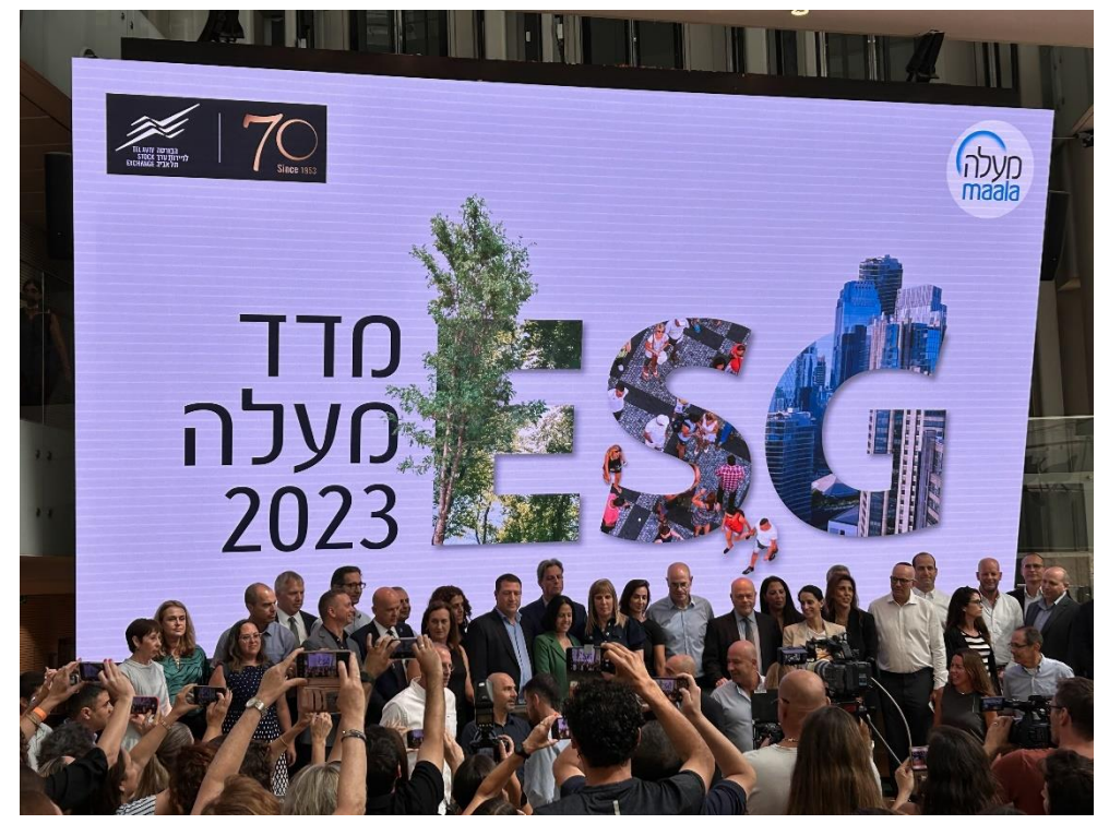
Publishing of the Maala ESG Index at the Tel Aviv Stock Exchange, July 2023.